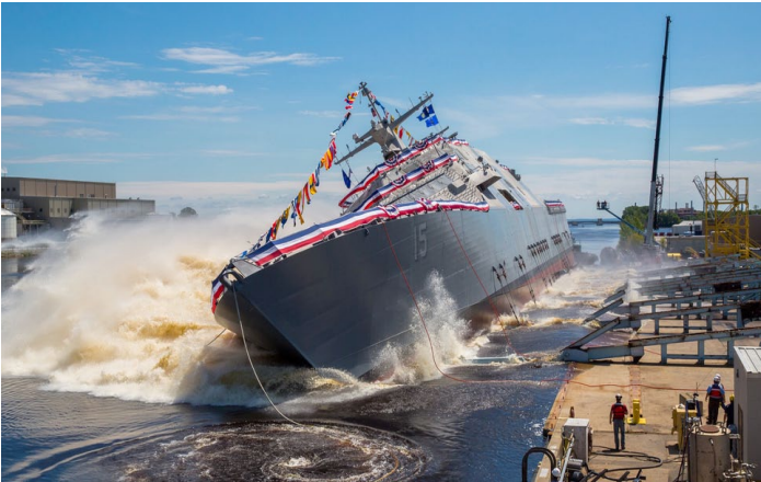
The splashing launch of the USS Billings.

Since the arrival of the USS New York in July, the new littoral combat ships (LCS) fascinate all of us at the Mayport Naval Base. The LCS will conduct most missions performed by the Guided Missile Frigates (FFG), Mine Countermeasures Ships (MCM) and Patrol Coastal (PC) class ships, as well as MH-53E mine-countermeasures helicopters. The first LCS (USS Milwaukee) was commissioned in November 2015 and the second (USS Detroit) was commissioned on October 22, 2016.