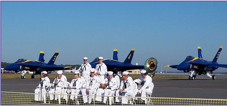
U.S. Navy sailors brass band.

Since December 14, 1975, SIU's Workforce Education and Development has had a home at Naval Air Station Jacksonville. Located in the southwest region of Jacksonville, Florida, SIU opened its doors for the undergraduate program in Vocational Education Studies, known now as Workforce Education and Development. And we are happy to have remained in Jacksonville over the years as our program continues to change and grow. We have been honored to continue serving