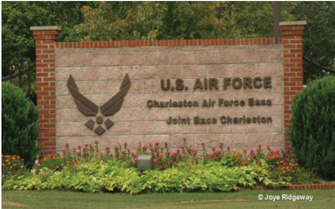
Joint Base Charleston, Charleston SC.

Joint Base Charleston (JBC), located in the middle of North Charleston, has a unique mission. They span across the Air Force, Naval Weapons Training Facility, and many federal agencies that work to protect our Charleston Shipping Ports and help with humanitarian missions around the globe. Joint Base Charleston's relationship with training facilities and other agencies is an invaluable asset to training and protection for our nation. It is no surprise that the Workforce Education and Development (WED) program has been a major part of that framework since its inception.